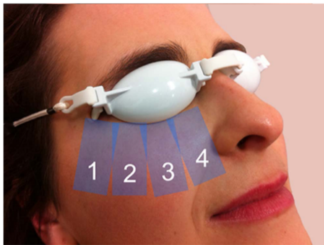
FIGURE 1. IPL treatment was applied to four periocular zones inferior to the eye, while the eyes were protected by opaque goggles. Both eyes received treatment, with a light-blocking filter applied to the tip of the E>Eye in the control eye.

Intense pulsed light devices contain high-intensity light sources, which emit polychromatic light extending from the visible (515 nm) to the infrared spectrum (1200 nm). The light is directed to the skin tissue and is then absorbed by the targeted structure, resulting in the production of heat ( >80^{\circ}\text{C} ), which destroys the pigmented skin lesions. Appropriate wavelengths can be selected for different targets depending on the absorption behavior and the penetration depth of the light emitted, and specific filters can be chosen to limit the delivery of wavelengths to the treatment area resulting in selective thermal delivery. 17,19